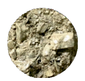
Walporzheimer Kräuterberg Slate